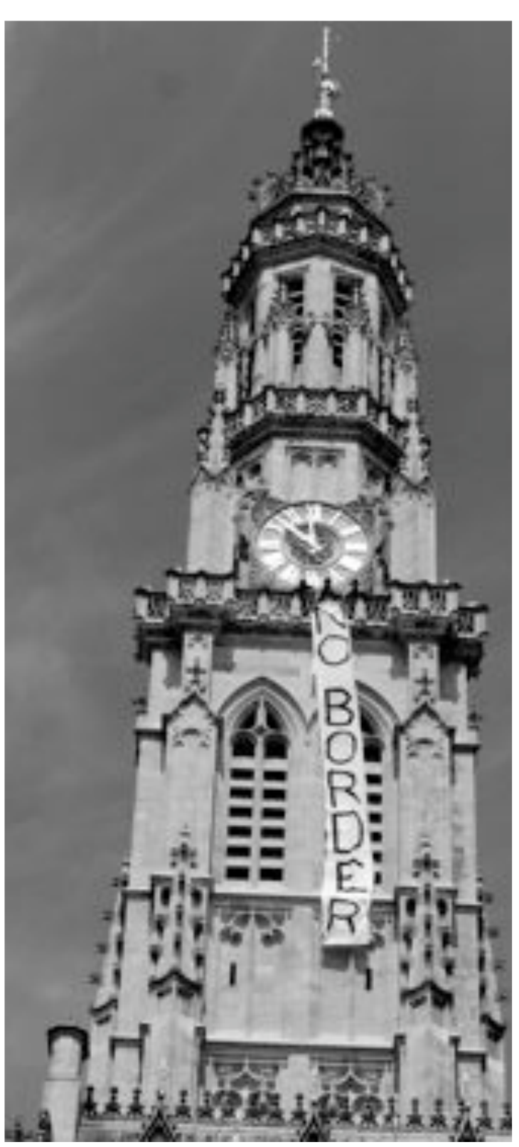
Arras market, France june 2010

It took 8 years for a No Border Camp to happen again in france. Only one year after, there is another one not far away from Calais. From the 25th of September to the 3rd of October 2010, the next one will take place in Brussels. Belgians activists managed to blocked Lesquin – near Lille - detention centre during Calais camp. Since then among other nice things, they simultaneously blocked 2 detention centres out of the 3 officially existing in belgium! The No Border network is being structured regionally near the UK-FR-BE border. It is capable to organise actions of various sizes. It's time to create new No Border collectives or to join it. Be it to organise an event for the camp infotour,